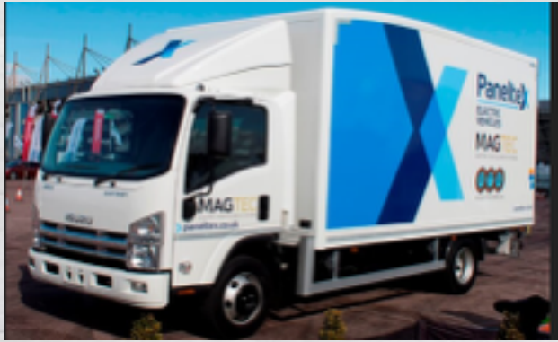
Paneltex: IKEA Sheffield