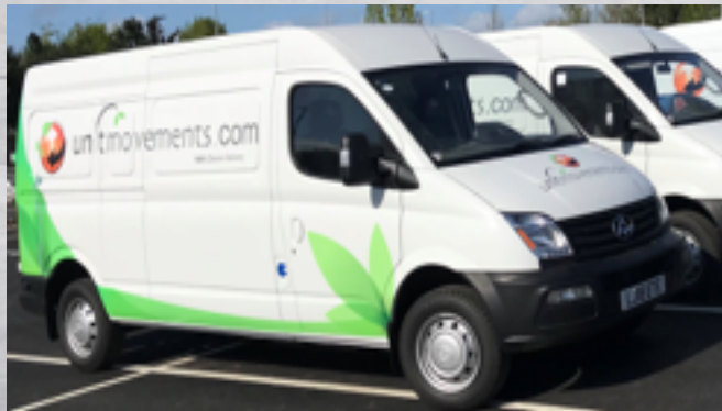
LDV: IKEA Exeter